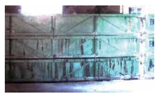
Figure 2. Fermentation warehouse.

an aerobic high temperature fermentation process with warehouse-style equipment based on practicality, efficiency, and energy conservation principles. The warehouse body was 4m long, 3m wide, 1.5m high, had a volume of 18 m<sup>3</sup>, and supplied oxygen using blast equipment (Figure 2).